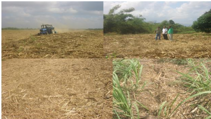
Fig.4. Tractor implement shredding the trash into finer pieces allows the tillers in the ratoon to emerge and grow faster. (Photo taken in a ratoon canes at Batangas , Philippines , Feb.17, 2014)

Many farmers are not into detrashing their canes. Shredding of the remaining trash after harvest appeared effective (Fig. 4) as done by conscientized sugarcane planters in Eastern Batangas, Philippines. They fully recognize the multiple benefits of NBC (no burning of canes).