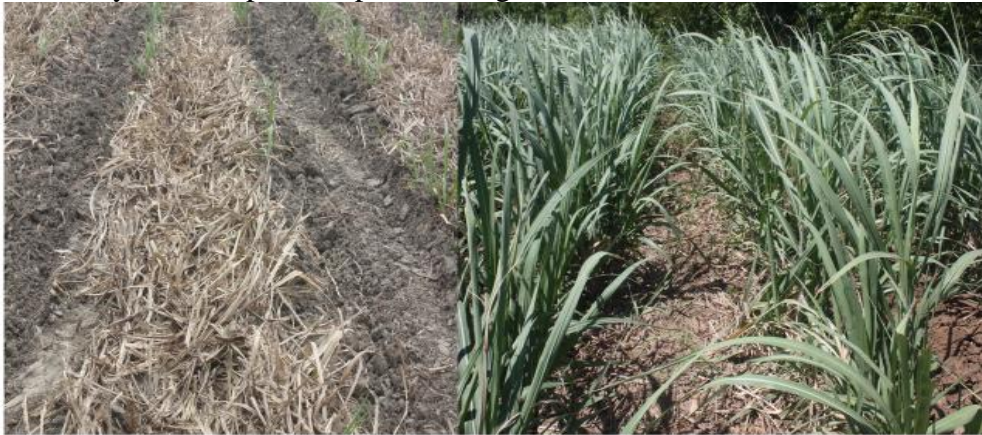
Fig.3. Trashes and tops are placed in alternate rows .The trash-free row serves as the row for cultivation to apply fertilizer. The pictures above are 1st ratoon in a farm in Negros Occidental, Philippines (Photo taken Feb.28, 2015)

2) The detrashed leaves activates the microbes to start decomposition leading to enhanced decomposition of the remaining trash at harvest time if moisture is available. This reduced the need to apply chemical fertilizer (Mendoza 2015);