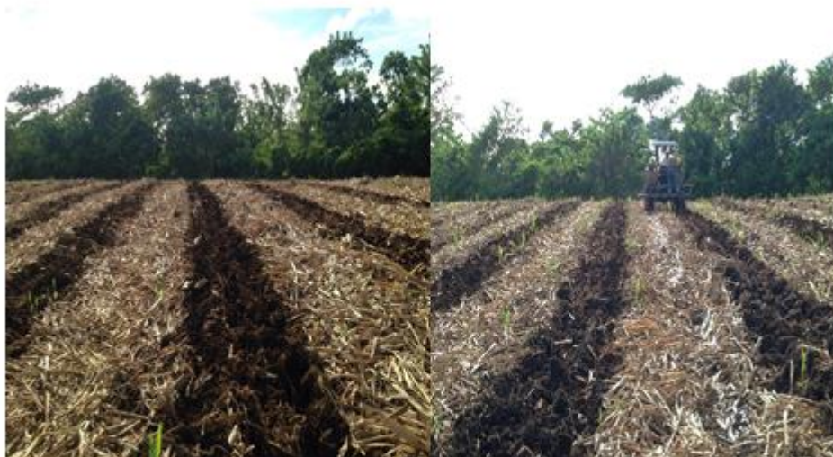
A sugarcane planter in Cadiz, Negros Occidental had adjusted their cultivating equipment to suit No burning canes after harvest to re-establish their ratoon canes. Other planters are afraid to this due to accidental or intentional burning

The cost of fertilizer usage (material + application) accounts for about 21% of the total variable costs of production (average for plant and ratoon cane). Trash farming improves the economics of sugarcane production. Where trash farming was implemented, net returns increased by 43% in the first ratoon crop. The trash-farmed ratoon crop achieved the lowest cost. It was 31% below the cost of the conventional plant crop and 10.0% below the ratooned conventional crop. The trash farmed crop had 20% higher ratoon tonnage yield (78 t/ha) than conventional cane (65 t/ha).