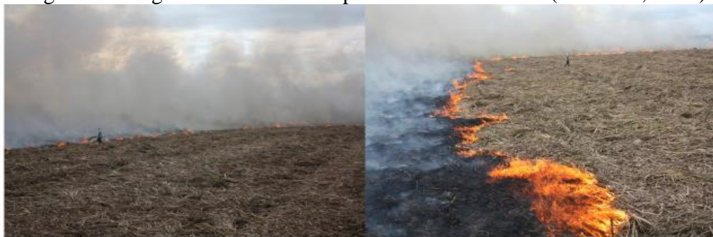
Fig.2. Post- harvest burning of sugarcane trash .To quickly burn, a farm worker lights on the trashes from one end to the other end of the field. Photo taken at Negros Occidental Philippines, Feb.20,2015

Burning canes, before or after harvesting, has many agricultural, environmental and health negative impacts .Burning canes liberate considerable amount of CO 2 and other GHGs .The estimated direct CO 2 emission from cane burning was 10,410 kg/ha. An additional 1,791 kg CO 2 /ha was estimated from the other gases (CH 4 = 467 kg CO 2 , CO = 1,241 kg CO 2 , and N 2 O=830 kg CO 2 ). This summed up to 12,204 kg CO 2 /ha which translate to about 37% the total greenhouse gas emission in cane production in the farm (Mendoza, 2014).