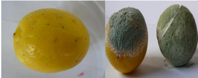
Fig. 1.b. External symptoms of blue and green mould comparing with healthy one. H= Healthy I= Infected