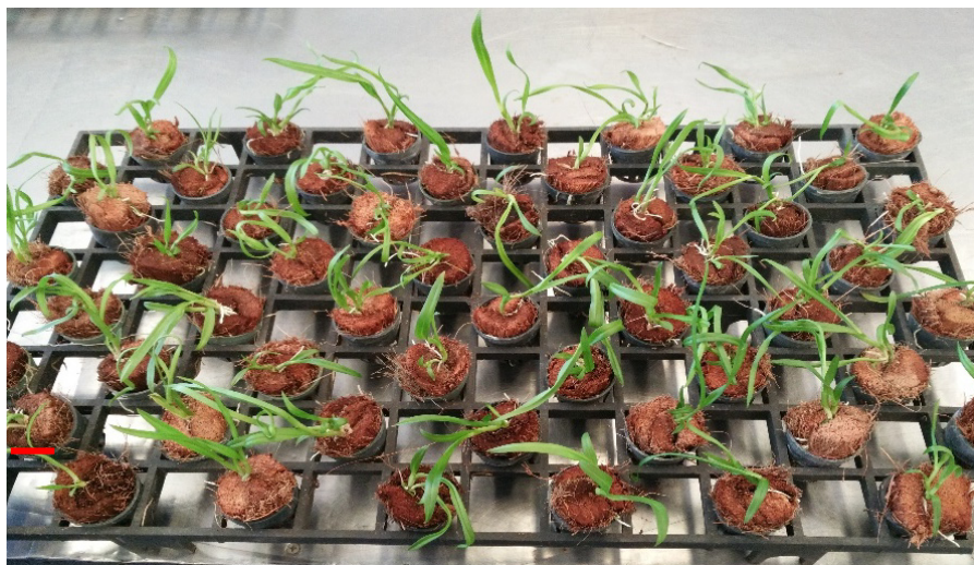
Figure 3 Dendrobium crumenatum Sw.; the complete plantlets derived from MS medium supplemented with 15 % (v/v) coconut water (CW) and 0.2 % (w/v) activated charcoal (AC) for 4 months of culture with well-expanded leaves in pots containing sterilized coconut husks after 2 months of transplanting. (Scale bar = 1 cm).

The transplantation stage continues to be a major bottleneck in the micropropagation of orchid. A substantial number of micro propagated plantlets fail to survive when transferred from in vitro conditions to a greenhouse or field environment. The greenhouse or field environment have substantially lower relative humidity, higher and intense light levels that are stressful to micro propagated plants compared to in vitro conditions [36].