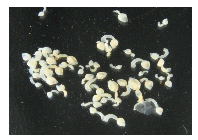
Figure 3 Pedunculate barnacles dislodged from gills.

Figure 2 Gills infested with pedunculate barnacles (arrows).