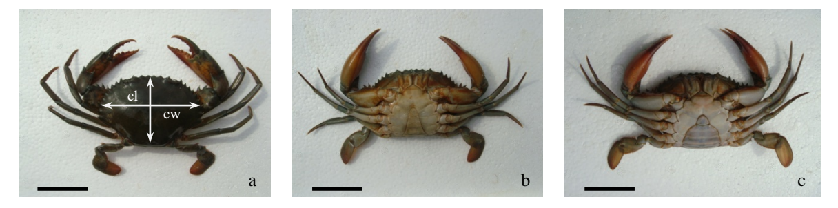
Figures 1 Scylla olivacea: a, dorsal view; b, male (ventral view); c, female (ventral view); scale bar: 5 cm.

Since there were five Octolasmis species previously recorded from portunid crabs in the northern Gulf of Thailand (see above), this study hence, was limited only in terms of population and interaction between parasites and their host including the distribution pattern.