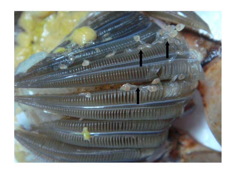
Figure 2 Gills infested with pedunculate barnacles (arrows).