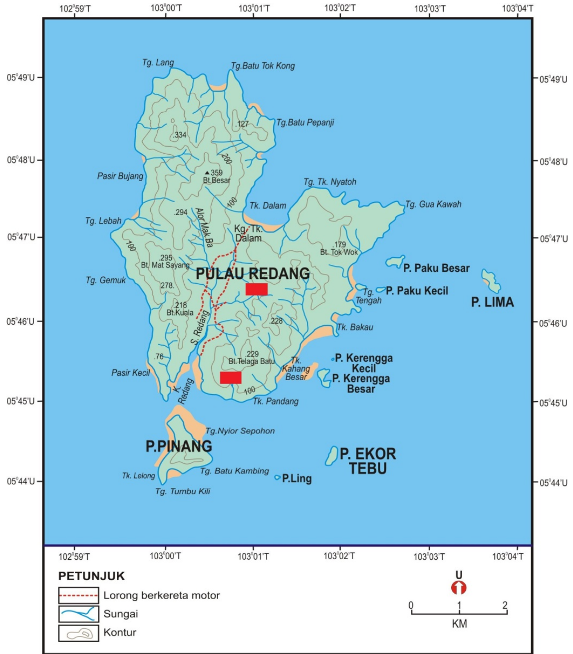
Figure 2 The location of the study sites, indicated by the red squares.