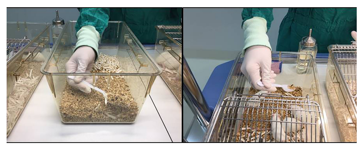
Fig. 1. Indirect sentinel test by transferring a spoonful of soiled bedding from the cage of the experimental mice (a) into the cage of the sentinel mice (b).

performed. Organ size and appearance were recorded.