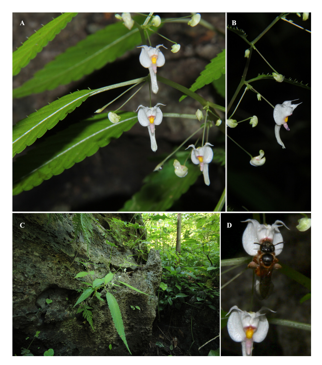
Figure 1. Impatiens capillipes Hook.f. & Thomson: A. front view of flowers and leaves; B. lateral view of flower; C. natural habitat; D. pollinator.

Habitat and ecology.— Growing on limestone in mixed deciduous forest, alt. 10–100 m (Fig. 1C). The population in Thailand co-occurs with Impatiens patula Craib and Curcuma roscoeana Wall. and flowers during the same period.