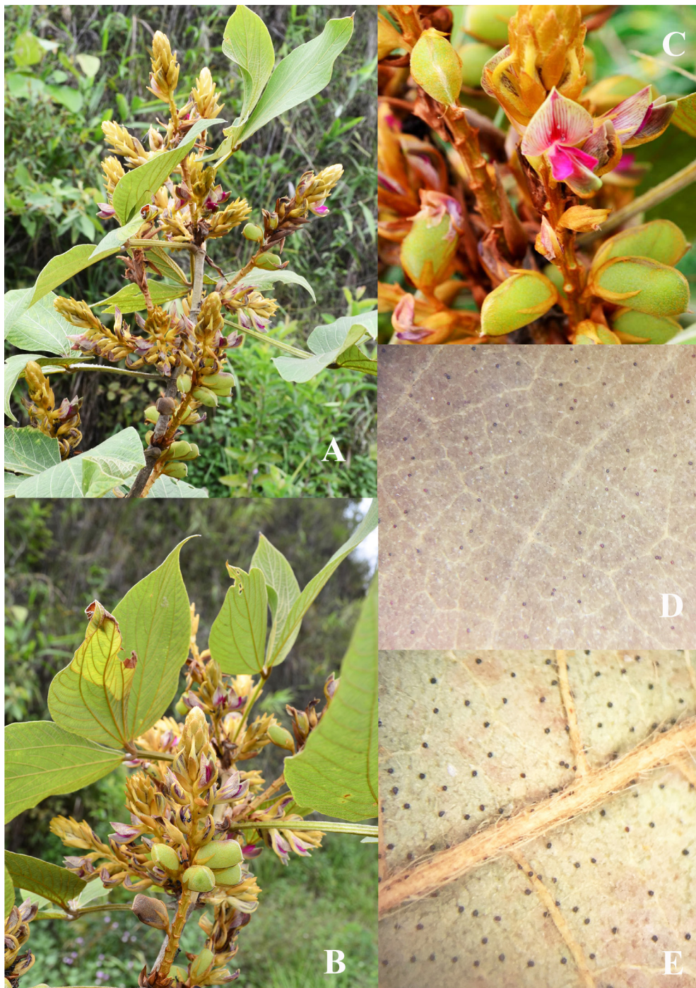
Figure 1. Flemingia latifolia Benth.; A. & B. Leaves, inflorescences, flowers and fruits; C. close up of flowers and fruits; D. Upper surface of leaflet showing resinous glands (Mattapha 1118, KKU); E. Lower surface of leaflet showing resinous glands and conspicuous veins (Mattapha 1118, KKU). A.–C., photos by S. Mattapha.