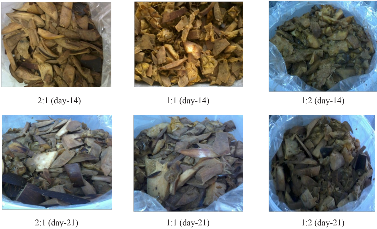
Figure 1 Picture of silage