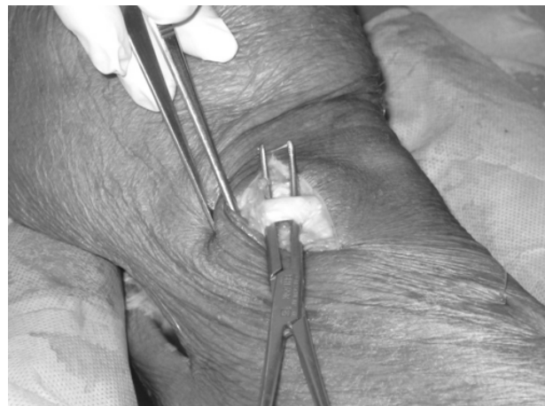
Figure 3 Semitendinosus tendon harvesting