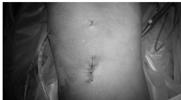
Figure 4 Surgical wound after surgery