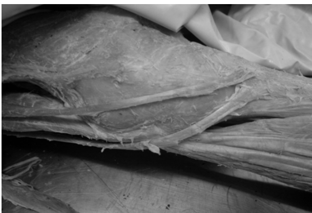
Figure 1 Pes anserinus insertion(Sartorius, Gracilis and

The semitendinosus tendon was identified and delivered into the wound. A right-angle clamp was placed around the tendon, and a loop used to tag the tendon. Peritendinous soft tissue was resected to cleanly expose the tendon. Blunt dissection and sharp dissection proximally and distally were performed until there are no adhesions. The surgeon finger can fully circle the tendon. Once the tendon was free of any soft tissue attachment, an opened-ended tendon stripper is carefully progressive proximally advancement. Critically, the harvester must be directed precisely in line with the tendon, toward ischial tuberosity, the proximal attachment