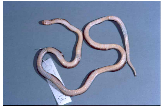
FIGURE 5. Ventral view of the body of the holotype QSMI 385.

1/1 postocular; no subocular; 7/7 SL; 1st SL small, 2nd and 3rd in contact with loreal, 3rd and 4th SL in contact with orbit, 5th to 7th SL large, 6th and 7th SL the largest; 1 long anterior temporal, with a smaller second one under its posterior part; 7/7 IL, first pair widely in contact behind mental, the four first ones are in contact with the chin shields on each side; single pair of chin shields, followed by three subequal small pairs of gulars directly preceding the preventral.