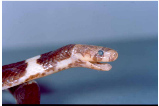
FIGURE 3. Right side of the head of the holotype QSMI 385.