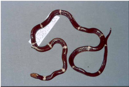
FIGURE 4. Dorsal view of the body of the holotype QSMI 385.