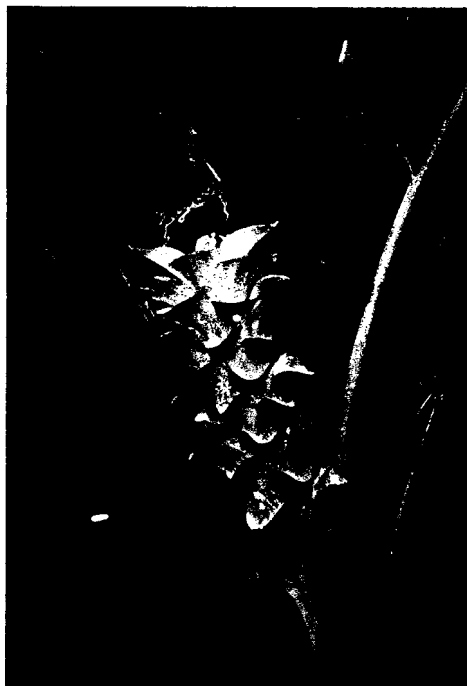
Figure 6. Curcuma sp. (Zingiberaceae) is a deciduous, perennial herb found in deciduous + bamboo, fire-prone areas. The 4-angled inflorescences with red-orange bracts are distinct. Photo: Mario Ambrosino, 7 October 1993 (Maxwell 93-1153).