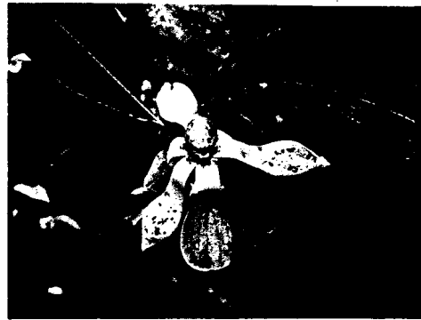
Figure 2. Talauma hodgsonii Hk. f. & Th. (Magnoliaceae), an uncommon understorey tree, is found in shaded places in more evergreen forested areas, especially along Rokee Stream. Photo: Mario Ambrosino, 12 April 1994 (Maxwell 94-500).