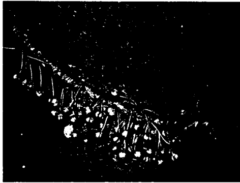
Figure 1. Dillenia pentagyna Roxb. (Dilleniaceae), a deciduous tree in deciduous + bamboo forest, produces inflorescences and infructescences on leafless branches during the hot (flowers) and early rainy (fruits) seasons. The trunk of the tree is in the background. Photo: Pat Corrigan, 15 June 1993 (Maxwell 93-610).