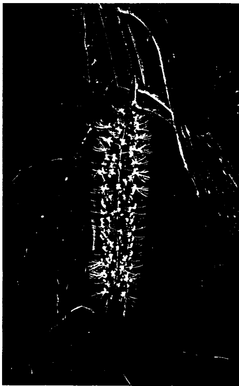
Figure 3. Capparis assamica Hk. f. & Th. (Capparaceae), distinguished by its narrow, lax, reflexed inflorescences and infructescences, this slender climber-shrub is found in shaded, primary, more evergreen forested places. Photo: Pat Corrigan, 11 April 1994 (Maxwell 94-487).