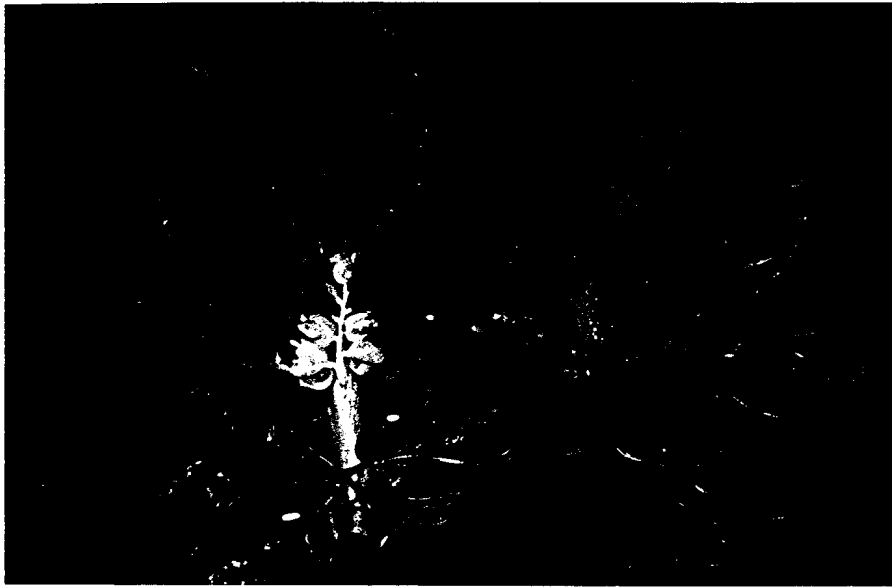
Figure 9. Globba substrigosa King ex Bak. (Zingiberaceae) grows exclusively on limestone outcrops in shaded evergreen habitats during the rainy season. Photo: Pat Corrigan, 16 June 1993 (Maxwell 93-643).