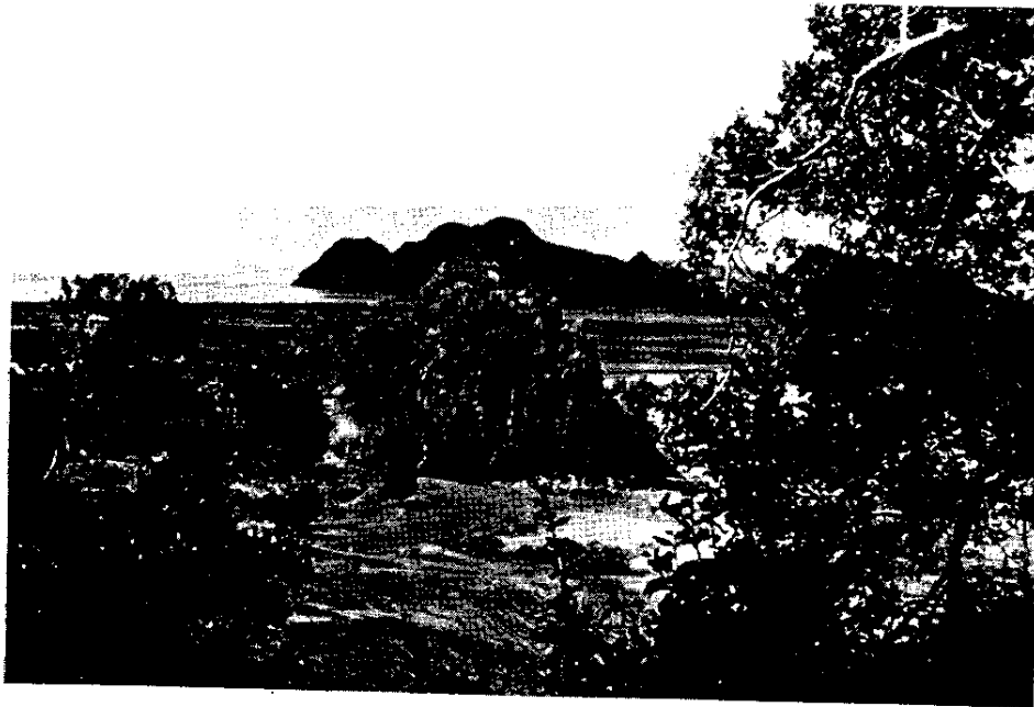
Fig. 4. Sam Roi Yot. From the lower limestone outcrops (alt. about 250 m.) towards the tidal plain.