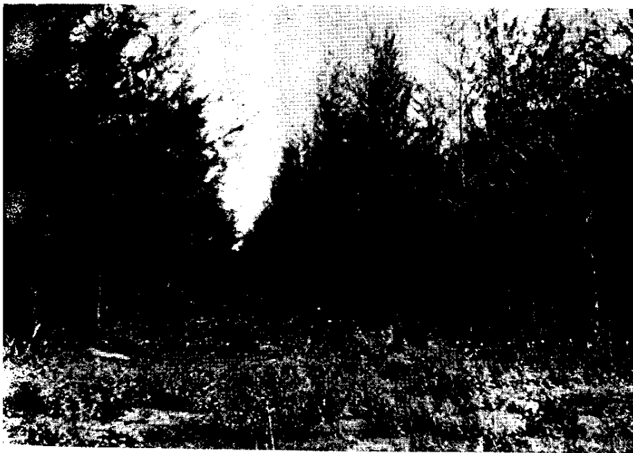
Fig. 10. Huai Yang. Casuarina plantation.