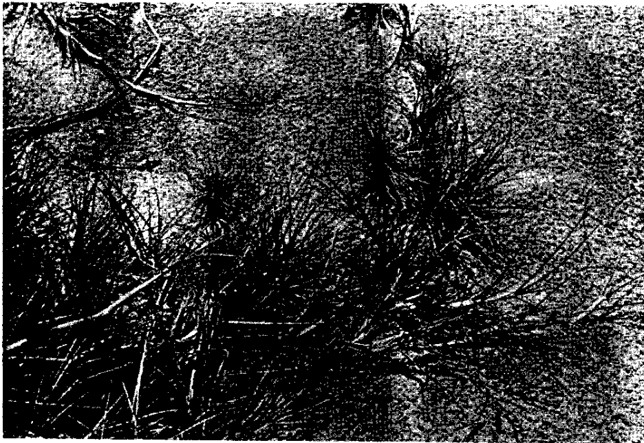
Fig. 7. Huai Yang. Spinifex littoreus on sandy shore.