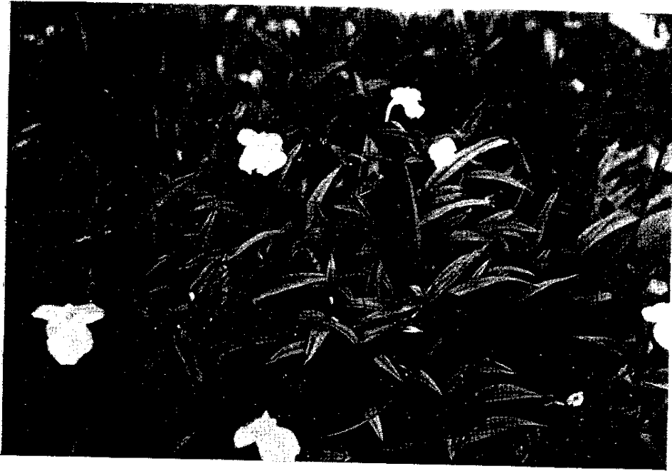
Fig. 3. Phu Mieng. Boesenbergia sp. common on the sandstone boulders.