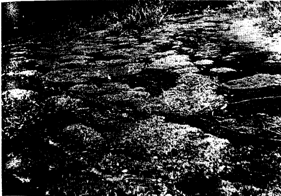
Fig. 1. Phu Mieng. Sandstone boulder with Sphagnum-Cladonia-Selaginella community.