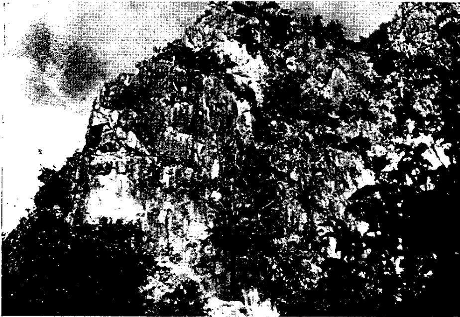
Fig. 5. Sam Roi Yot. Steep limestone mountain.