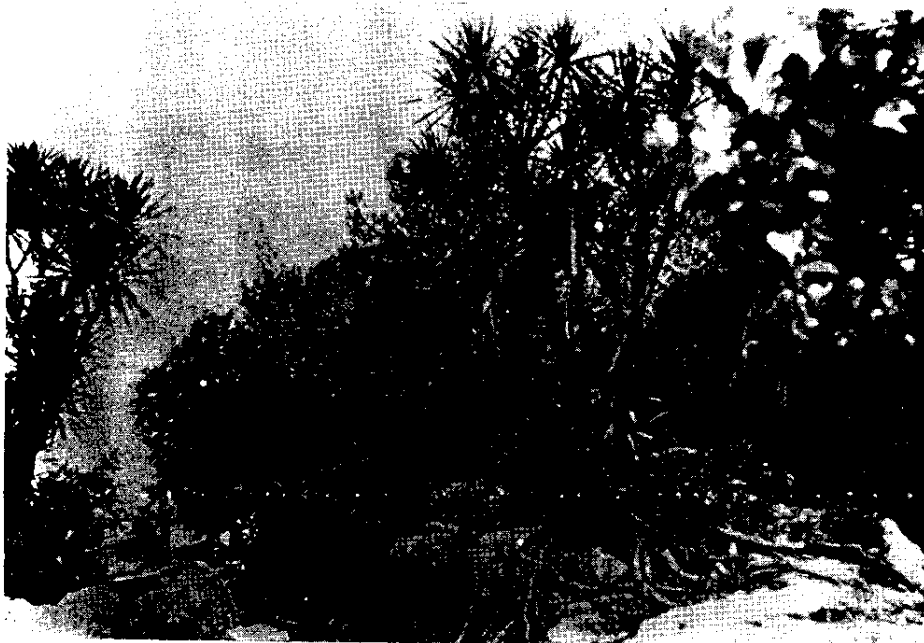
Fig. 6. Sam Roi Yot. Dracaena sp. on bare limestone rock.