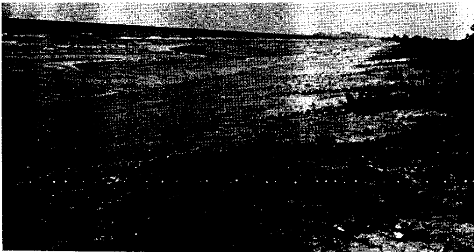
Fig. 8. Huai Yang. Sandy shore with Ipomoea pes-caprae community.