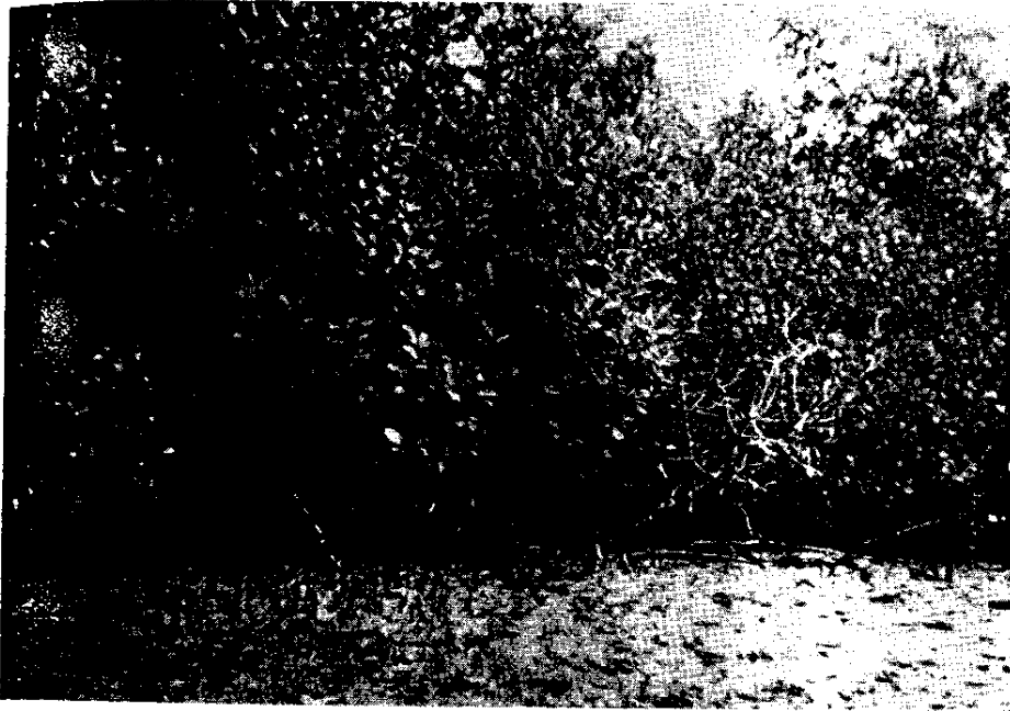
Fig. 9. Ban Saphan. Mangrove.