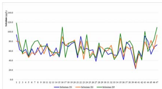
Fig. 1 Overall serum selenium level of patients (n = 47).

serum selenium level was lower than normal physiological range on all study day. This study confirmed previous finding that there is reduction in