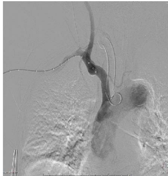
Fig. 3 Aortogram before stent graft deployment showed no contrast extravasation or pseudoaneurysm formation.

movement, radiotherapy or prolonged intubation, infection, hypotension, malnutrition, corticosteroid use, all are risk factors in TIF formation (5,11,12) . Two mechanisms are supposed to be etiology of TIF. First is mechanical force generated by either the