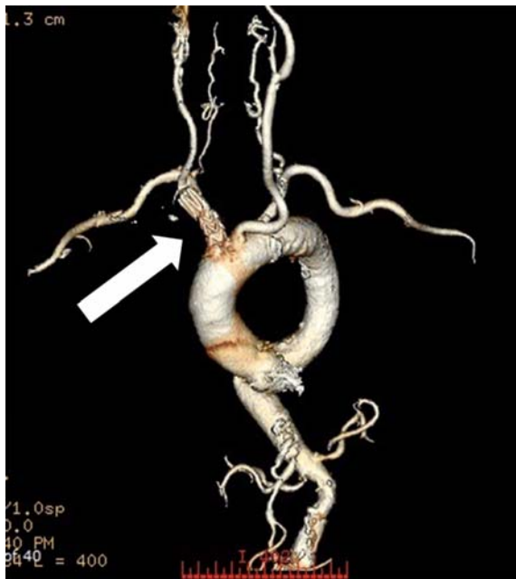
Fig. 5 CTA thoracic aorta at 1 month postoperatively showed no endoleakage and no migration of stent graft.

tracheostomy tube cuff or tube tip. Second mechanism involves pressure generated beneath the angulated neck of a tracheostomy tube produced ischemia anteriorly on the tracheal mucosa and into the innominate artery (5) . Clinical clues suggestive the diagnosis of TIF are bleeding at 48 hours or more after tracheostomy which usual risk and may spontaneously subside, low lying tracheostomy tube, pulsation of tracheostomy tube, present of predisposing factors such as infection, hypotension, malnutrition, corticosteroid use (12) . A sentinel bleed is reported in about 35% of patients and the other 65% of patients first have massive hemorrhage (3) . Goal of initial management in TIF are 1) control the airway, and 2) tamponade the bleeding while the patient is resuscitated and an OR is prepared (2) . Over inflating cuff of tracheostomy was recommended to be initial management with 85% rate of success (11) . If hemorrhage is ongoing, endotracheal tube insertion to protect airway and simultaneous removed tracheostomy tube to maintain ventilation and oxygenation followed by blunt finger dissection of the pretracheal space and manual compression of innominate artery against sternum can control the bleeding before transferred patient to operating room (14) . Definitive treatment of TIF requires median sternotomy and ligation of the