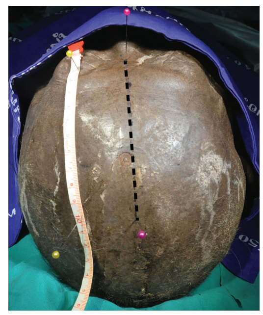
Fig. 1 Superior view cadaver scalp, showing nasionbregma distance (dashed line), and mid-superior orbital rim-coronal suture (tape).

The scalp of all samples was then removed by mid-sagittal and biauricular incisions to expose the cranial surface. The measurements as described above were then replicated (Fig. 2).