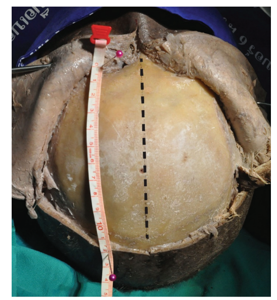
Fig. 2 Superior view of nasion-bregma distance (dashed line), and mid-superior orbital rim-coronal suture (tape) on the skull of a male cadaver.