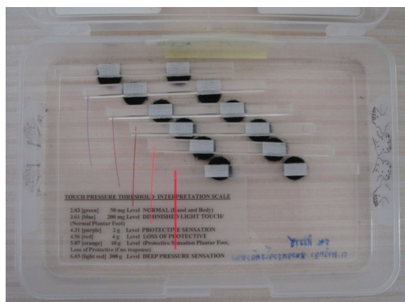
Fig. 3 Monofilament kit used in the study.

From univariate analysis, the factors found to associate with high BI were the lesion of erythematous plaques/papules (crude OR 17.44, 95% CI 2.03-150.04, p = 0.009), absence of anhidrosis (crude OR 3.29, 95% CI 1.23-8.78, p = 0.018) and presence of type II leprosy reaction (crude OR 46.22, 95% CI 8.30-257.41, p < 0.001). Multiple logistic regression or multivariate analysis was analyzed only for the factors found to have significant or borderline significant association with high BI, as demonstrated in Table 3, type II leprosy reaction was the only robust factor for high BI profile