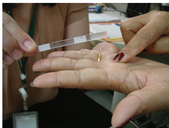
Fig. 4 C-shape monofilament technique.