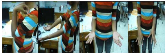
Fig. 3 Clinical and range of motion of chronic Monteggia left elbow 24 months after surgery (Patient No. 10)

of a good result but in our series has one patient (No. 8) has 13 years old at the time of surgery and preoperative delay for 60 months shows good result with no osteoarthritis change. No patient with an age of less than twelve years at the time of open reduction with an interval of less than three years between the injury and open reduction showed subluxation of the radial head or osteoarthritic changes of the radiohumeral joint.