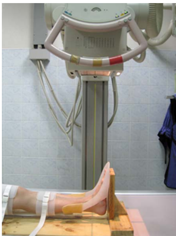
Fig. 1 The picture demonstrates the radiographic method to obtain a supine anteroposterior ankle film with the specially designed splint

landmarks were created from these radiographs, including one line and two points. First was the axis of distal tibia, which connecting between midpoints of tibial diaphysis and metaphysis. Second was the true center of the ankle, which identified as the center of the talus at the level of subchondral bone (13) . And the third was the anatomical center of the ankle or the extreme-midpoint, which defined as the midpoint of a line connecting the medial and lateral most rims of the malleoli (Fig. 2). Then, the distances between the distal tibial axis and these two points were measured in