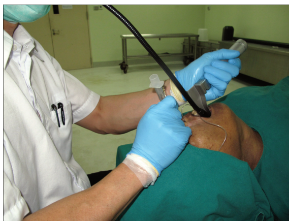
Fig. 2 During nasal intubation, the head of the FSSC is inserted into the oral cavity instead of the endotracheal tube until the head reaches the oropharynx to visualize the laryngeal orifice during the intubation

The assessment session: On the afternoon in the assessment session after the training, the students performed only one timed trial with each device. All four cadavers were changed but the scenarios were the same. The groups of the medical students were randomly assigned to perform the tasks in one of two cadavers of the two scenarios. A