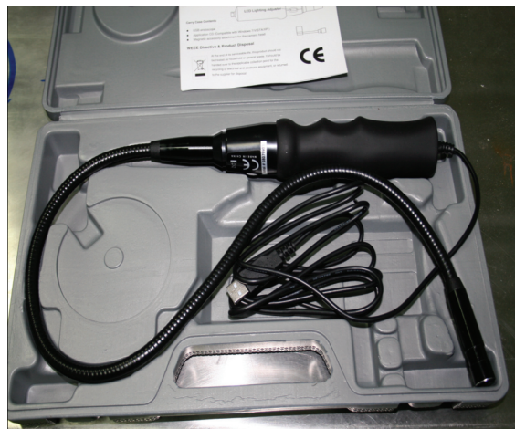
Fig. 1 The flexible snake scope camera (FSSC)

Endotracheal intubation: The cadaver was in supine position with a pillow under the head. The student adjusted the cadaver head to flex the neck and