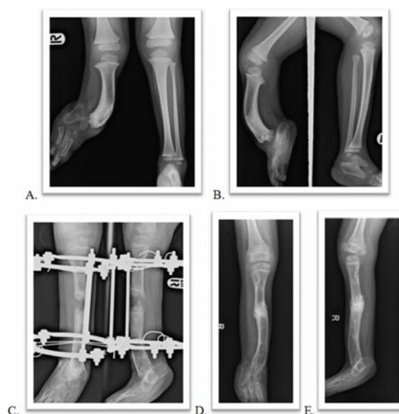
Fig. 1 Fibular hemimelia Type II is shown above A, B) Preoperative standing radiograph of a three-year old boy presenting with right fibular hemimelia Type II with a limb-length discrepancy of 6 cm at initial and absent 2 toes C) Radiograph of lengthening using the Ilizarov method D, E) Postoperative radiograph at follow-up after bone lengthening, showing mild equinus foot.

The goals of managing fibular hemimelia cases include, managing the limb deficiency, correcting bone angulations, and achieving a well, plantigrade, and painless foot. Previously, for patients with severe foot deformities with a predicted severe limb-length