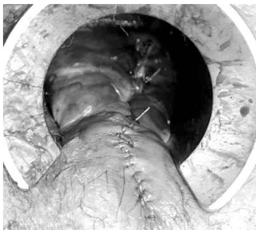
Fig. 3 Closed hemorrhoidectomy wound