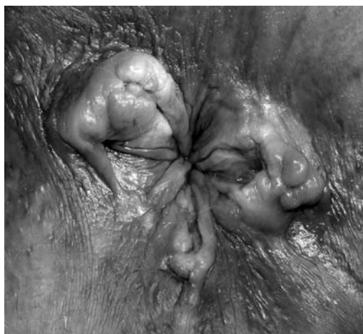
Fig. 4 Wound dehiscence

With this anoscope, the anal sphincter was properly stretched and fixed, keeping it away from the excised tissue. The hemorrhoidal tissue was always removed in the plane just superficial to the anal sphincter. The width of resection was limited by the edges of working space of anoscope, thus allowing a safe approximation of the cut edges with minimal chance of anal stricture. The procedures were performed by senior residents under supervision, or by fellows or surgical staff.