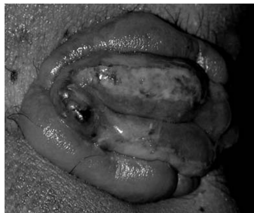
Fig. 1 Prolapsed thrombosed hemorrhoid with strangulation

Patients were operated on in the prone jackknife position. Operations were carried out under local perianal anesthesia (modified Nivatvongs's technique) (5,6) . The local anesthetic agent (containing 1% xylocaine with adrenaline 20 ml mixed with sterile water 20 ml) was gradually injected in submucosa or internal sphincter at 3,6,9 and 12 o'clock. After the sensation was tested, the prolapsed hemorrhoidal tissue was reduced. Handle-less Fansler's anoscope (3.2 cm in outer diameter) was then inserted to expose the anal canal. Hemorrhoidal tissue was lifted with non-tooth forceps and excised with large metzenbaum (Fig. 2). Bleeding was stopped by electrocoagulation. The wound was primarily closed with 4-0 VICRYL RAPIDE* (Polyglactin 910) suture (Ethicon, Johnson and Johnson company, Novartis Animal Health U.S. Inc), running continuously (Fig. 3).