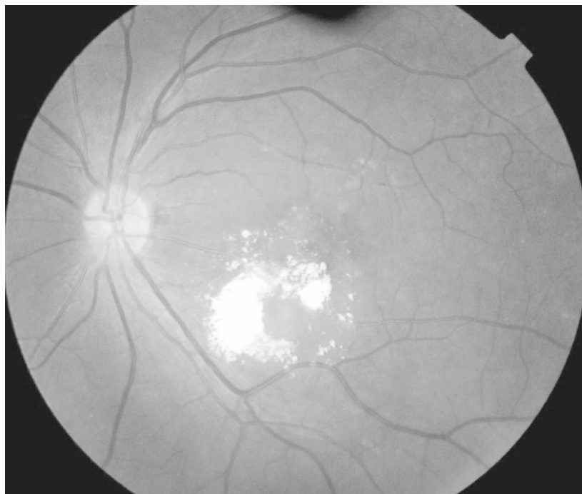
Fig. 1 The subretinal polyp-like structures locate at the center of circinate exudates with overlying retinal pigment epithelial detachment

b Statistically significant (Chi-square test, p = 0.001), c Statistically significant (Chi-square test, p = 0.032), a Detachment more than 4-disc area