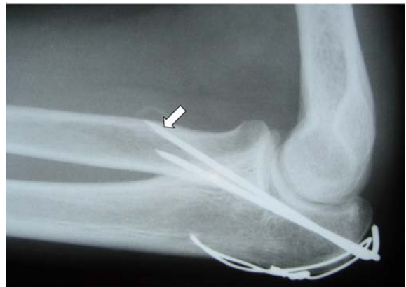
Fig. 2 Plain radiograph shows the protrusion of K-wires through the volar surface of the ulnar cortex (arrow)