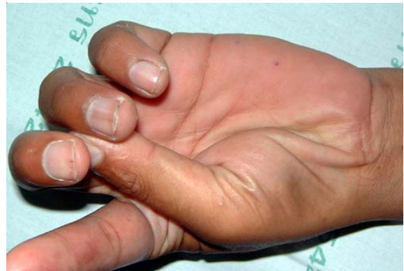
Fig. 1 Picture of the left hand reveals atrophy of the thenar muscle. The patient can not perform the opposition

Although the median nerve palsy from the internal fixation of olecranon is rare, a missed or