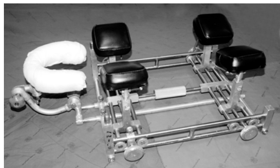
Fig. 1 Canadian frame

An awareness of the potential injury of the brachial plexus during prone positioning using a Canadian frame is important. Patients should be correctly placed on the pads of the Canadian frame to avoid nerve damage.