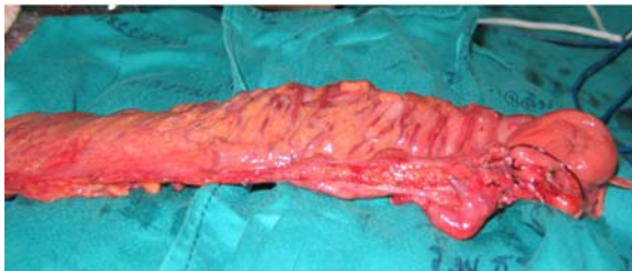
Fig. 2 Show dissected pedicle interposition colon

and the colon was pulled up rail-road pass the retro-sternum route. During the general surgeons did intra-abdominal bowel anastomosis, the plastic surgeons did the microvascular anastomosis at cervical site.