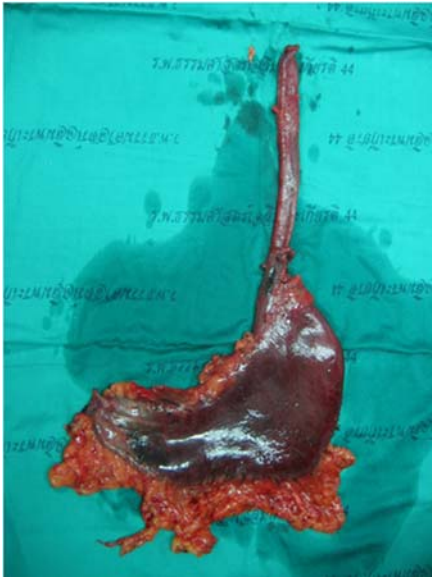
Fig. 1 Necrosis of esophagus and stomach in case of suicide corrosive ingestion