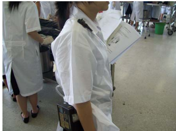
Fig. 2 Personal air sampling

analyzed with descriptive statistics. The difference of mean of formaldehyde concentrations between indoor air and breathing zone were tested by using Wilcoxon Mann-Whitney method. Furthermore the data from questionnaires were analyzed as percentage of each symptom and were tested to find any relationship of burning eyes or eyes irritations between contact lenses users and no contact lenses users by using Pearson Chi-Square test.