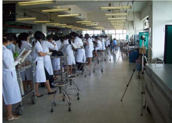
Fig. 1 Indoor air sampling