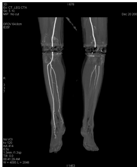
Fig. 2 Leg computer tomographic angiography demonstrating occlusion of left popliteal artery

The nineteenth post operative embolectomy day, foramen ovale was closed with device closure and temporary IVC filter was removed. The patient could