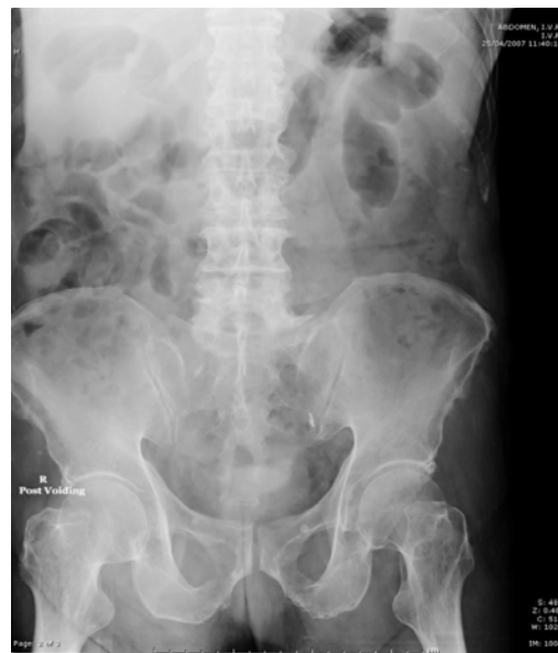
B. Post-voiding IVU after corrective surgery