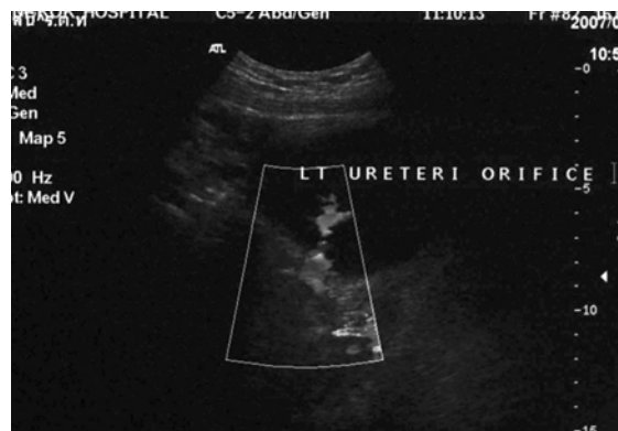
C. One year follow-up ultrasound Postoperative ultrasonography