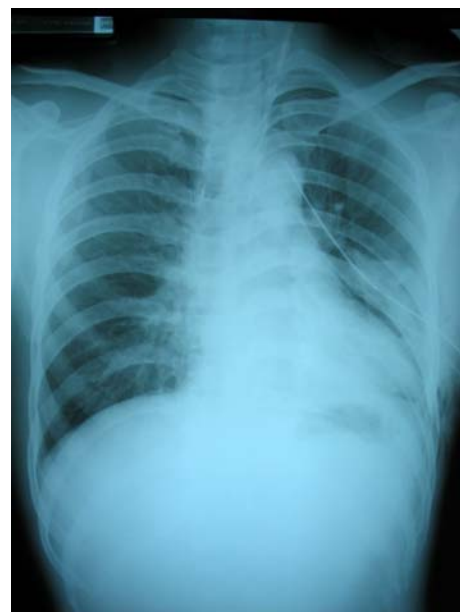
Fig. 2 CXR showed left pneumothorax and elevated left hemidiaphragm with chest drain inside