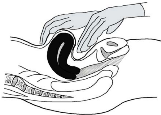
Fig. 2 Lower uterine compression method in treatment of acute postpartum hemorrhage by compressing at the lower uterine segment with counteracting pressure from fundus

parity, body weight, gestational age, and previous PPH status. There were no significant differences between the two groups in terms of maternal demographics.