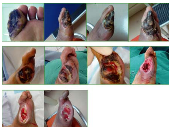
Fig. 2 The progression of left 1 st toe status after the injection of NMPB-ACPs in the fifth patient demonstrating the adequacy of granulation tissue at the base of amputated wound for complete healing

the complete healing of the stump. Among these patients, one also had an improvement of intermittent claudication from 100 to 400 meters within three months and no symptom after six months. One patient had significant improvement of healing with the adequate granulation tissue at the base of the first toe stump (Fig. 2). Due to poor compliance and severe foot infection originated from the second and third toes with septicemia, this patient subsequently underwent below the knee amputation. On the contrary, one patient (16.7%) had no improvement after the administration of NMPB-ACPs. The ischemic process of the affected limb was progressively worse, requiring below the knee amputation (Table 1). All patients survived the 6-month follow up period.