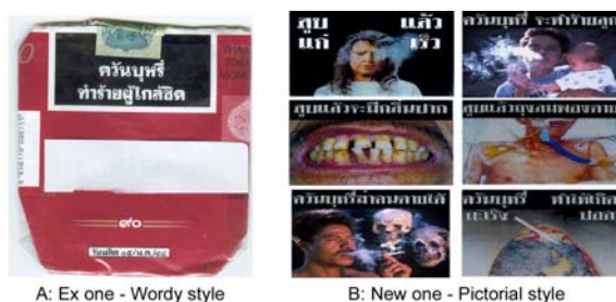
Fig. 1 The HWL New-one, Ex-one

The questionnaires comprised of 5 parts; demographic data, a perception of the HWL (11 items for the Ex-HWL, 22 items for the New-HWL, which expressed knowledge, motivation, and cues for intending to quit smoking in the future), stage of change in smoking cessation behaviors (18 items) (7) , the process of change is used in the stage for forcing the employee to change their behavior in each stage from smoking until to quit (33 items) (8) , and decisional balance measurement about self decision to quit smoking, which consisted of two parts. Part 1 referred to the benefits and smoking satisfaction and Part 2 referred to dissatisfaction or obstacles associated with smoking