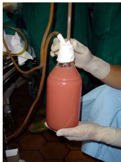
Fig. 4 Iatrogenic chylothorax