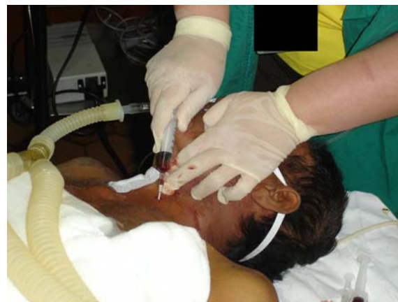
Fig. 2 Internal jugular vein catheterization