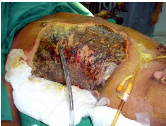
Fig. 1 Characteristic of burn wound

pinkish, milky-appearing chylous fluid was drained. The patient symptomatically improved immediately after the thoracostomy tube insertion, however; he went on to require mechanical ventilatory support due to burn wound sepsis. He was then placed on a low-fat, high-protein, high-carbohydrate enteral diet. Thoracostomy tube output decreased rapidly over the following four days (1400 ml on the first day, 700 ml on the second day, 240 ml on the third day and less than 50 ml/day from the fourth day). The color of fluid also changed to a clear, yellow color 4 days later. Due to burn sepsis, he required mechanical ventilatory support. The chest tube