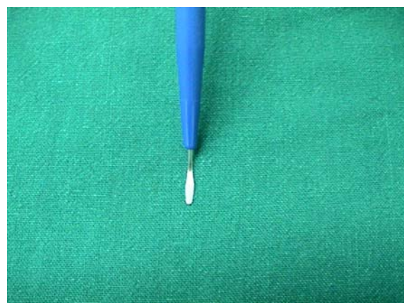
Fig. 1 A nuclear supporter