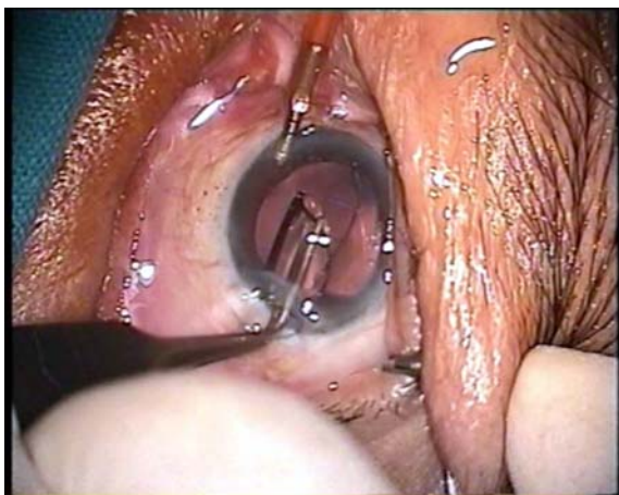
Fig. 4 The foldable intraocular lens implantation using the forceps

Post operative evaluations were performed at one week, one month, three months, and six months. Intra-operative/post operative complications and visual acuity were evaluated. The corneal endothelium was measured pre-operatively, 1 month, and 3 months after surgery using a confocal specular microscope.