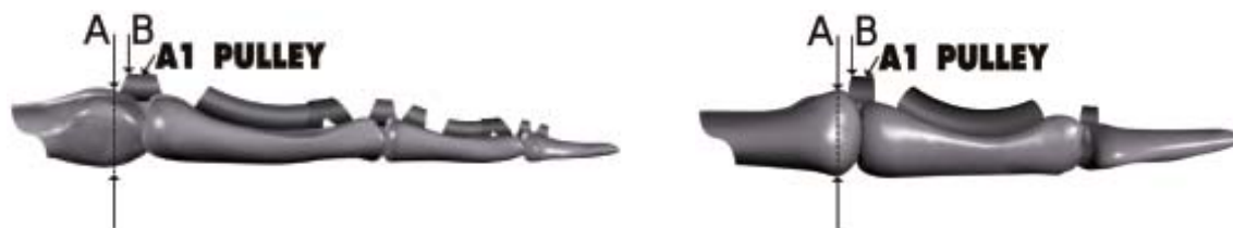
Fig. 1 Landmarks for measurements of proximal A1 pulley margins with relation to the central tip of knuckle which lined up perpendicular to palm (A) The distance from the proximal edge of the A1 pulley (B) to the perpendicular line from the knuckle to the palm of each fingers (left) and thumbs (right) was measured

Of 297 visits, 78 (26.3%) were related to other conditions such as diabetes, hypertension, hyperlipidemia, gout, and a case with tendon sheath ganglion. The other 219 (73.7%) were not related to anything.