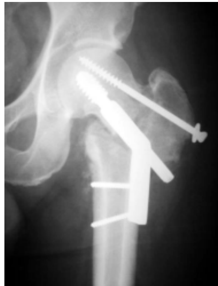
Fig. 2 After removal of the cannulated screws, the fracture was stabilized with DHS and an anterotational screw