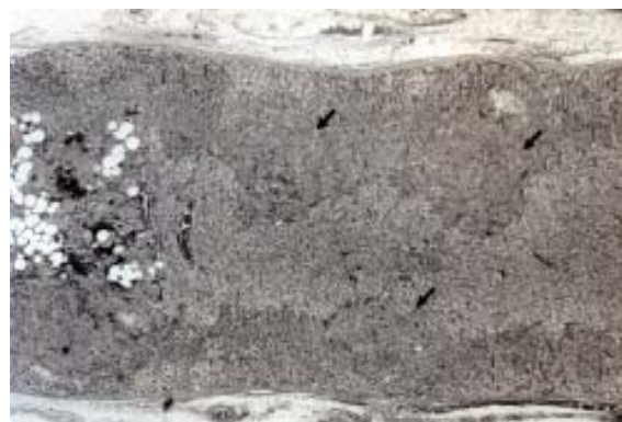
Fig. 1 Micronodules (arrow) are present at the adrenal cortex

The laboratory investigations were Hb 14.8 gm/dL, Hct 45%, WBC 7,800 cells/mm 3 , PMN 55%, band