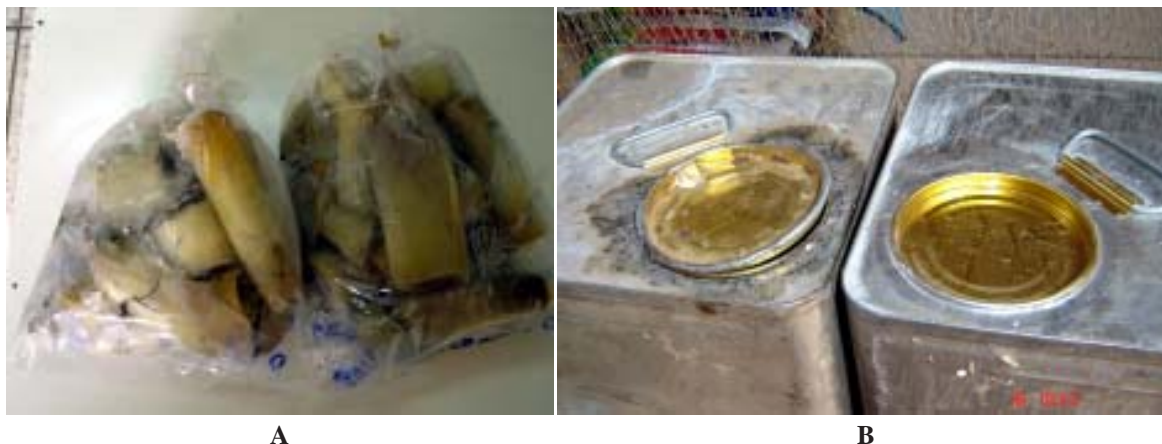
Fig. 1 A: home-canned bamboo shoots, B: container

hospitalized. In mild cases, they developed gastrointestinal symptoms, mild dysphagia, dysarthria, diarrhea, ptosis, and diplopia bilateral without neuromuscular respiratory failure. However, in severe cases, they developed the symptoms of dysphagia, dysarthria, diarrhea, ptosis, diplopia, and generalized respiratory and muscle weakness. Forty-two cases developed respiratory failure, neuromuscular failure, and autonomic nervous system failure. This group needed ventilators to support their respiratory system.