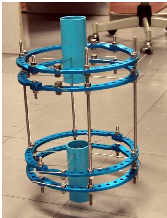
Fig. 2 System configuration