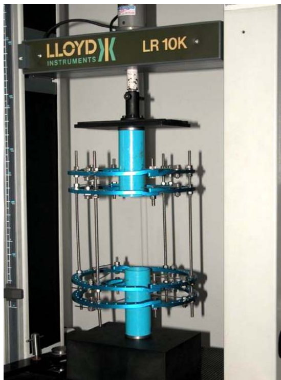
Fig. 3 The ring fixator system under the testing machine