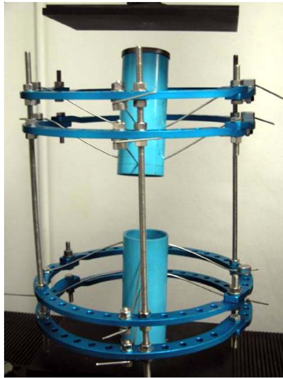
Fig. 5 Shows the plastic deformation of K-wire, the ring fixator configuration still maintained (Post-test)

The mean yield strength of the three-ring system was 4654.567 \pm 229.5704 Newtons with displacement at 57.3067 \pm 1.1836 mm (Fig. 4). The overall system still maintained its contour; there was no statistical significance of the ring diameter between pre and post test at 95% confidence (mean difference is -0.0225 \pm 2.312818 mm (mean \pm SD)) (Table 2). There was no statistical difference of the gap between ended rings pre and post test at 99% confidence (mean difference is 0.027917 \pm 0.366226 mm (mean \pm SD)) (Table 3). The extension or failure of the system was caused by plastic deformation of Kirschner wire and loosening of the wire clamps (Fig. 5).