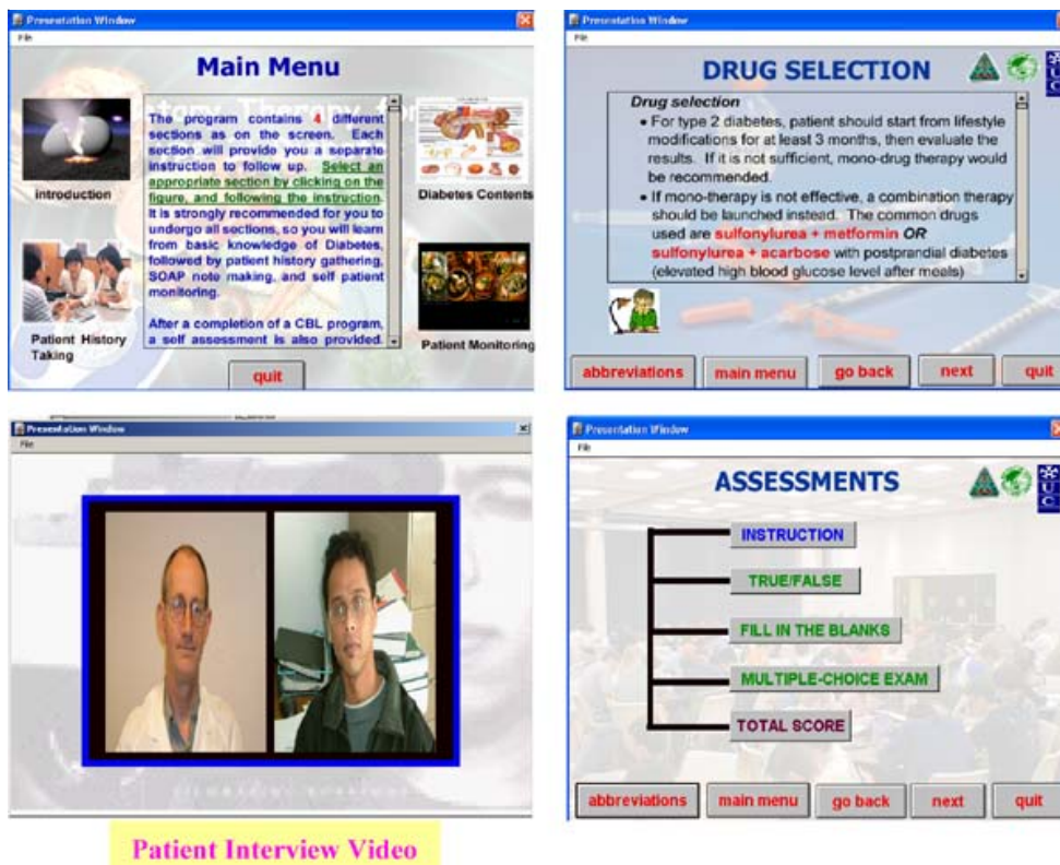
Fig. 2 The CBL program pictures screens