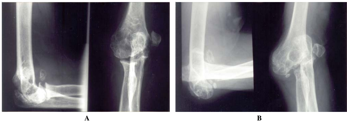
Fig. 2A, 2B Anteroposterior and lateral radiographs of the right elbow at the initial injury and 2 years afterward

his left elbow. Seventeen years ago, he had had an electric shock and fell to the ground on his left elbow. He went to a hospital and he was given some pills. There was no fracture around the elbow. Since having suffered that injury, he has had a persistent numbness at the elbow and below. He first noticed a painless hard mass at his left elbow and went to see a physician at a hospital. The mass was excised without any complication. He could perform his daily activities as usual without any clinical symptom except for the persisting numbness at the elbow and below. Seven months before coming to our hospital, he fell to the ground on his left hand. He felt some discomfort at his