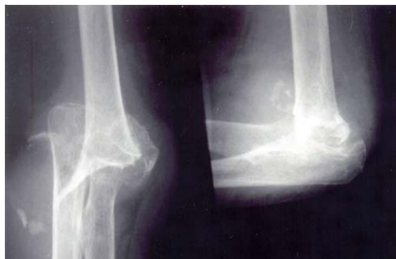
Fig. 1 Anteroposterior and lateral radiographs of the left elbow

On physical examination, the left elbow was deformed with minimal tenderness at the medial aspect. The range of motion was 140/0/25. There was gross instability of the left elbow shown in valgus and varus stress test. The motor power was grade V/V in both upper and lower extremities. The pinprick sensation and the joint positional sense were within normal limits. The deep tendon reflexes were normal. Other systems were examined and found to be within normal limits.