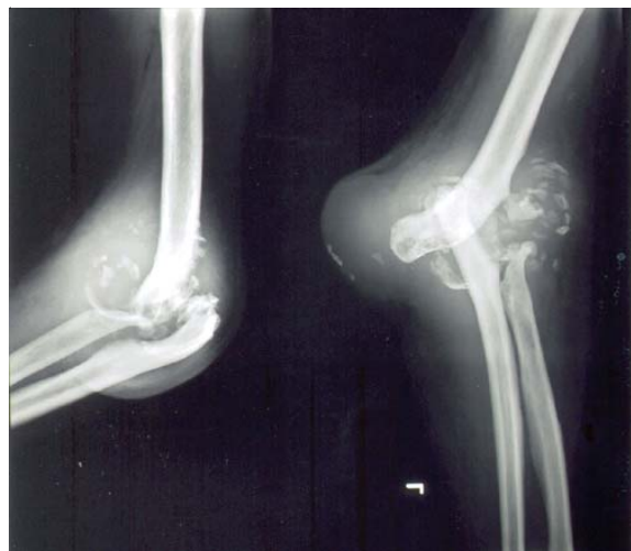
Fig. 3 Anteroposterior and lateral radiographs of the left elbow showing marked destruction of the joints, osteophytes, and numerous loose bodies within the joint space

The pathologic and radiographic features of advanced neuropathic arthropathy are indeed characteristic, the "5Ds" which come from debris, density (sclerosis), destruction, disorganization and dislocation. The radiographic findings can be divided into