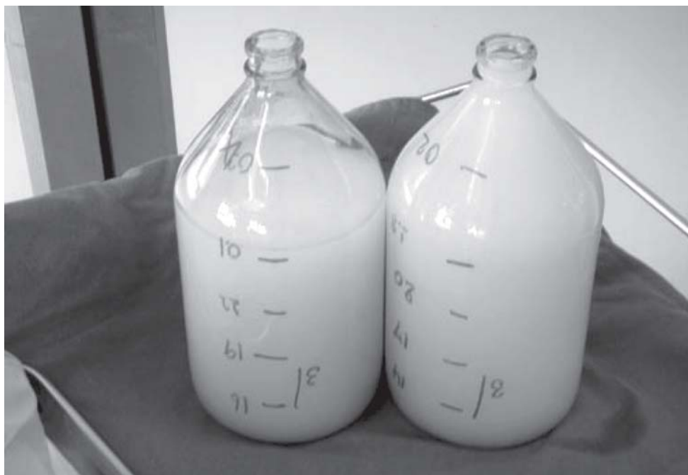
Fig. 2 Milky white peritoneal fluid