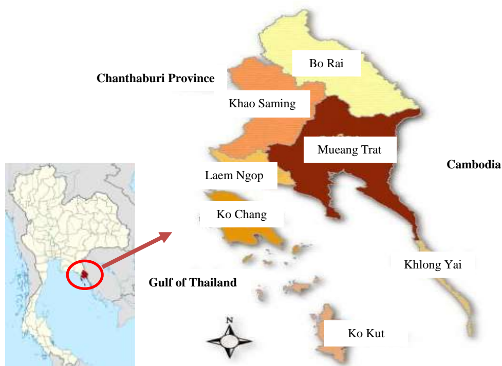
Figure 2. Map of Trat Province, Thailand