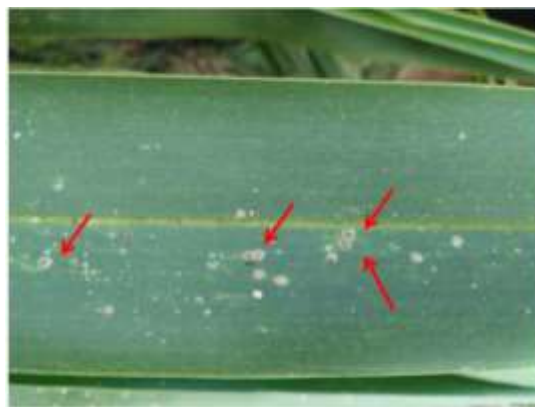
Figure 2. Comperiella calauanica specifically parasitizes on CSI Aspidiotus rigidus (↙) as shown in this sample photograph