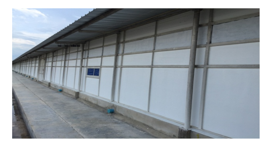
Figure 2. The natural lighting control house

The evaluation of lighting control on the characteristics of broiler carcasses from slaughter house found that the experimental group had an average of disqualified broiler carcasses not significantly difference between natural lighting control and natural light with an average of 7.40% and 6.12% respectively (P>0.05).