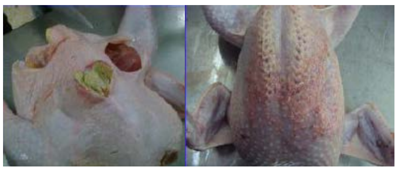
Figure 4. The breast blisters

the muscular dystrophy is caused by excessive use of the trapezius muscle to spread the wings to cool of the body, which can be prevented by controlling the ventilation system in the house property (Achiraya, 2013). The breast blister (Fig.3) are mainly caused by bacteria infection and unsuitable litter flor handling, resulting in the wetting and lapping causes skin inflammation, infection (Ritz et al. , 2014).