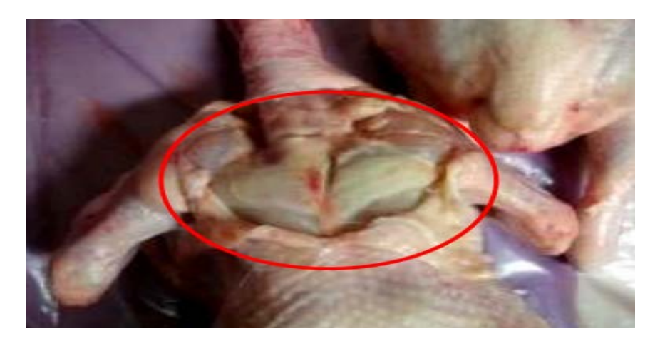
Figure 3. The muscular dystrophy

The evaluation of lighting control on the characteristics of broiler carcasses from slaughter house found that the experimental group had an average of disqualified broiler carcasses not significantly difference between natural lighting control and natural light with an average of 7.40% and 6.12% respectively (P>0.05).