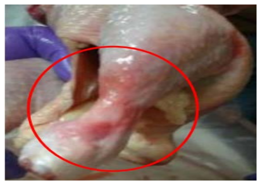
Figure 6. The hock bruise