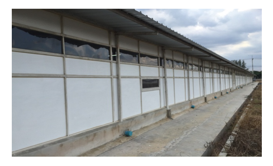
Figure 1. The natural light broiler house with channel of natural light space

productive performance ages 0 - 42 days the average weight gain 2,811.32 and 2,819.20 g/head, the accumulative feed intake 3,420.24 and 3,514.31 g/head, the average feed conversion ratio 1.49 and 1.52 and culling rate and mortality rate 3.87% and 4.00% in natural lighting control and natural light respectively (P>0.05). Which this may have channel of natural light space 0.30 \times 105 m. (Fig. 1). This is not large when compare with the space of broiler house side wall and it have only one light channel under the eaves, so it was not directly exposed to the sun. In addition, in broiler house the lighting was provided by the lighting system according to the lighting program during broiler chicken raising. It was not affected the performance of broiler production in any way. By the lighting program is in accordance with regulations of the Department of livestock on the protection of poultry welfare, which requires that the chicken house must have brightness more than 20 lux and have a darker period of more than 6 hours/day (Pennapa, 2011). The evaluation of lighting control on the characteristics of broiler carcasses from slaughterhouse found that the experimental group had an average of disgualified broiler carcasses not significantly difference between natural lighting control and natural light with an average of 7.40% and 6.12% respectively (P>0.05).