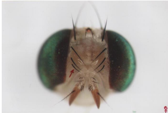
Figure 2 Red brown eyes and the frontal parts of G. fasciventris