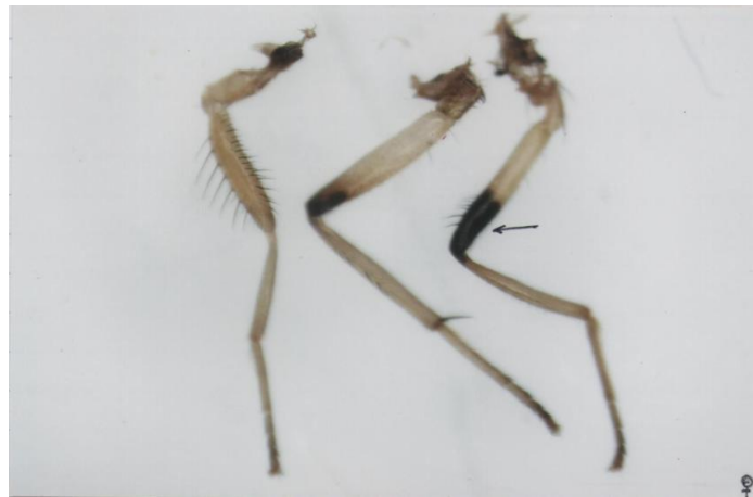
Figure 5 leg appendage of G. fasciventris