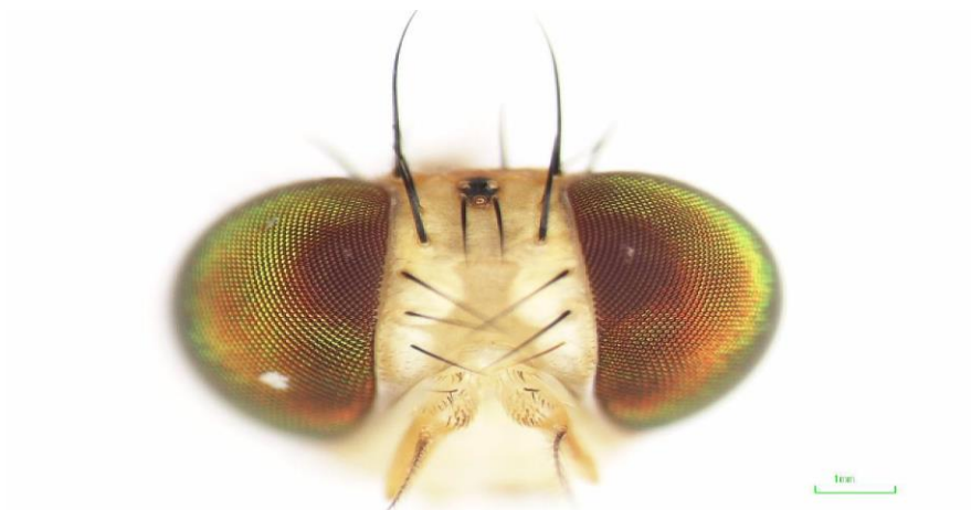
Figure 7 Setae on frons of G. soror