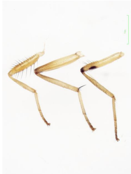
Figure 8 Leg appendage of G. soror