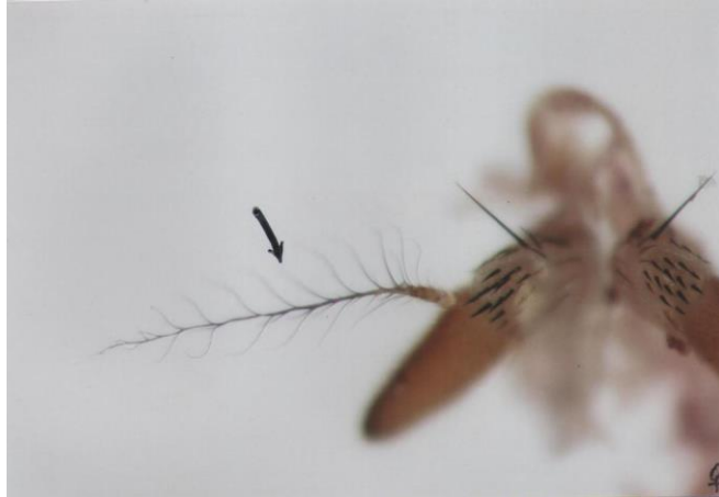
Figure 4 arista on the third segment of antenna