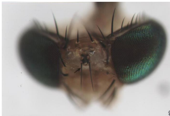
Figure3 Ocellar setae (arrow point)