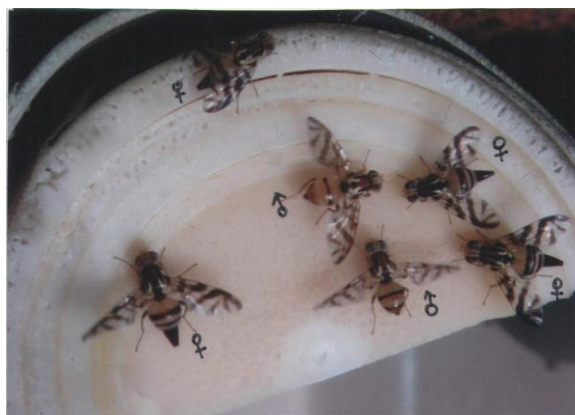
Figure 1 Males and females of G. fasciventris