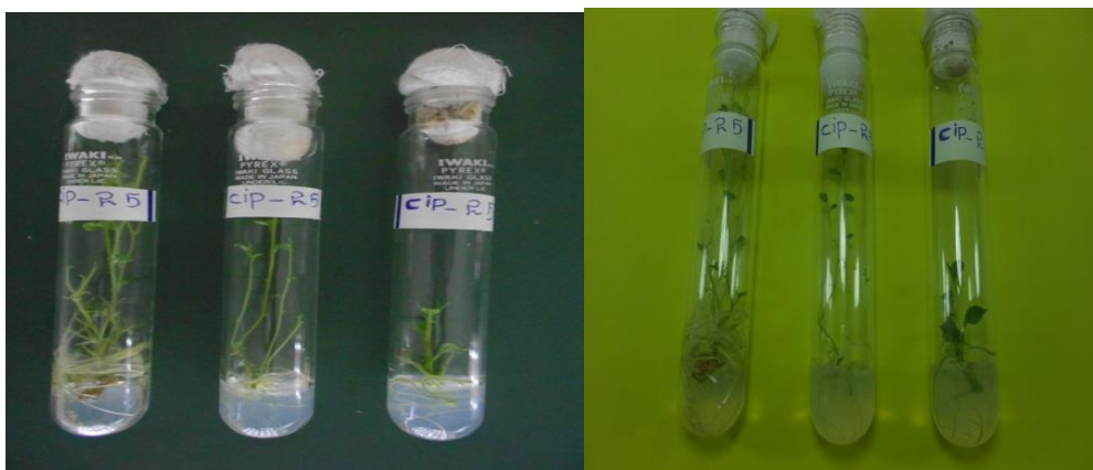
Fig: 1.2 Effect of different hormone concentration on virus free plantlets.