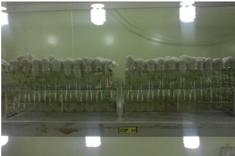
Fig: 2.2 Role of sucrose concentration on virus free plantlets.