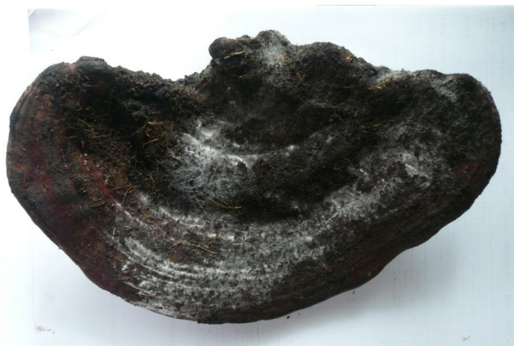
Fig. 1. Fruit body of Ganoderma boninense infected to Oil Palm Trees in Malaysia

The fruit bodies of Ganoderma were identified as Ganoderma boninense . Pure cultures were isolated from samples from Thailand and from Malaysia.