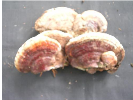
Fig. 2. Fruit body of Ganoderma infected to Oil Palm Trees in Thailand