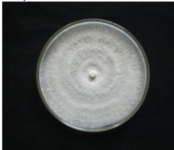
Fig. 3. Pure culture of Ganoderma on potato dextrose agar at 7 days