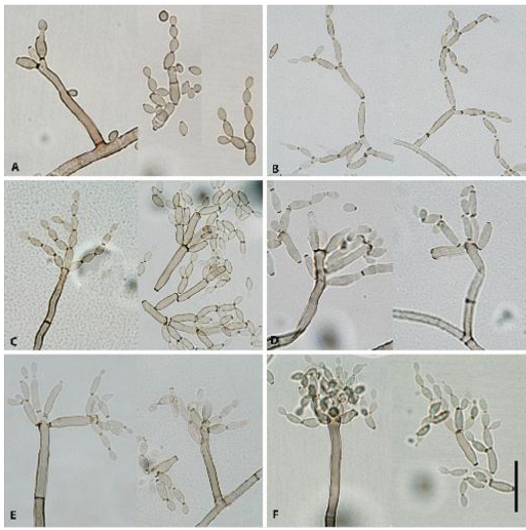
Fig. 2. Cladosporium spp. Conidiophores, conidial chains and connidia. C. cladosporiodes (A), C. cucumerinum (B), C. perangusum (C), C. psedocladosporiodes (D), C. tennuissimum (E) and C. xylophilum (F). Scale = 20 (A, C–F), 10 (B) μm.